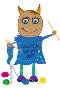
P Pilly Perseverance