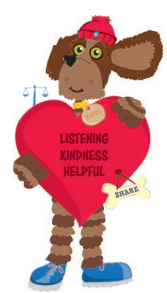
R Rover Respect