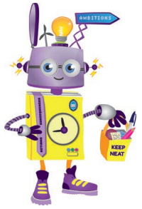
A Aamaal Accountability

We encourage pupils to demonstrate each of our values