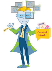
E Ehsaan Empathy