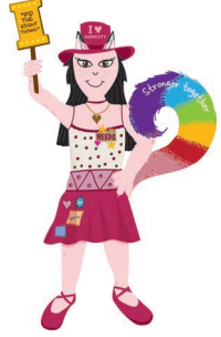
I Isla Integrity