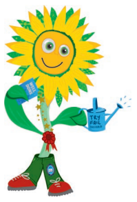
S Sunny Self-Confidence